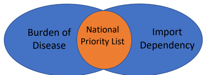
FIGURE 3. Consolidated modeling of the priority lists from the burden of disease and trade dataset to arrive at the national priority list.

Using the listed medical devices in the priority list that qualified expert group approval, these medical devices were mapped to their current domestic manufacturing