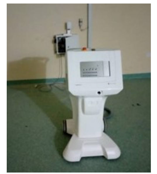
FIGURE 1. A 25-channel Saginova HDR afterloader brachytherapy unit installed by the local engineer.

expensive Co-60 sources.<sup>13,14</sup> It was therefore imperative to find a quick solution.