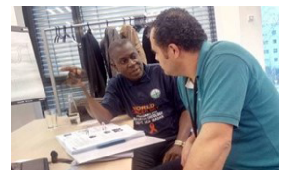
FIGURE 2. The radiotherapy engineer at the training facility in Germany.

The RE successfully installed the equipment, loaded the Co-60 source, and conducted acceptance testing in the four radiotherapy centers (Figure 3). Barring the occasional logistic problems, the installation was uneventful and did not lead to problems the German engineers would not have encountered, such as broken cables and a damaged SafeLogic compact arising from inadequate packaging.